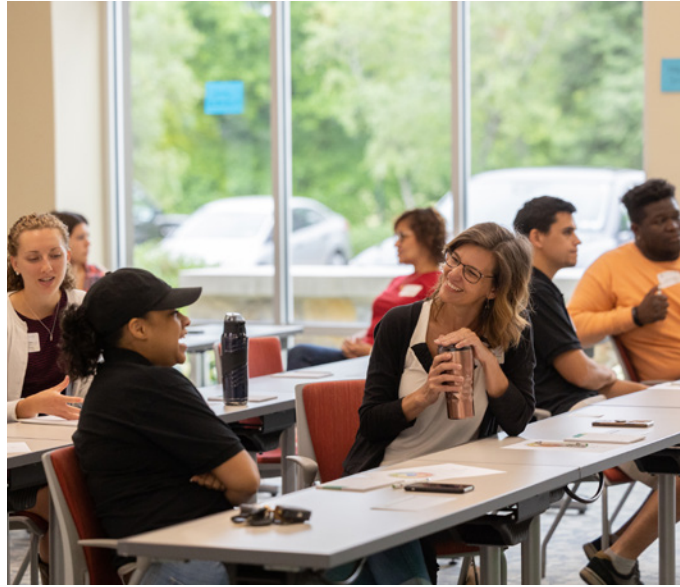
Greenfield Grows Educational Workshop

To see all upcoming educational opportunities, visit: greenfieldlancaster.com/event-calendar