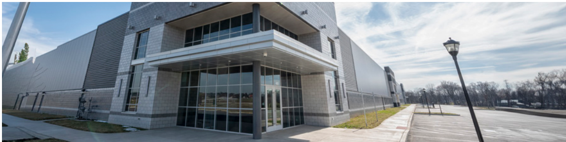
Thaddeus Stevens Transportation Center at Greenfield

“Our commitment to growth includes the expansion of the mind.”